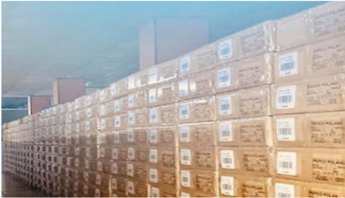
Finished Goods Section